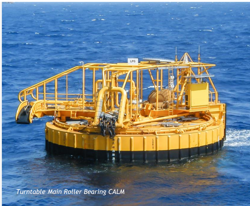
Turntable Main Roller Bearing CALM

Imodco terminals enable bulk liquid carriers to perform cargo loading, un-loading, bunkering and de-ballasting operations simultaneously. We offer customizable turntable Wheel & Rail or Main Roller Bearing designs, both optimizing safe, operations as well as maintenance activities.