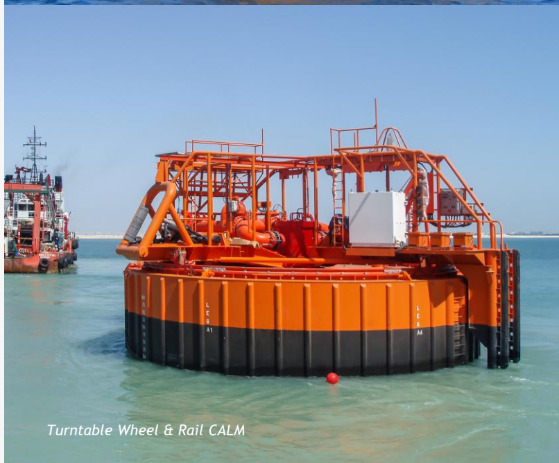
Turntable Wheel & Rail CALM